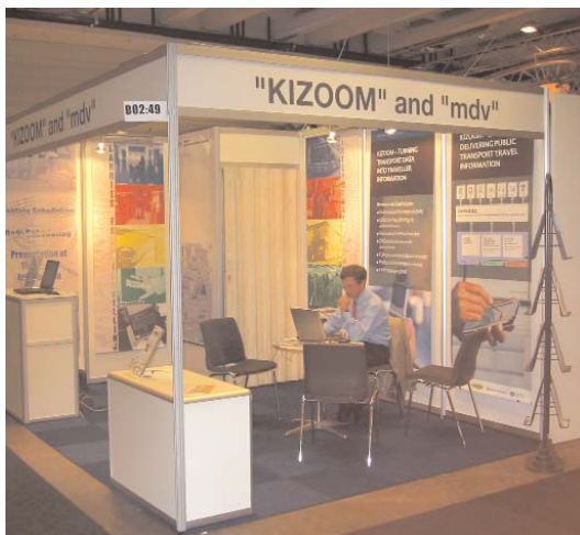
Parallel to the conference mdv shared a stand with its partner KIZOOM from the UK at the international Exhibition Public Transport 2003 in Gothenburg

After a short presentation of the nominees, all conference participants had the chance to vote. The MVV intermodal journey planner was awarded 5th place.